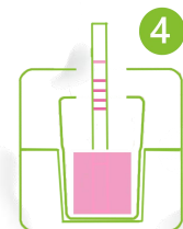
Incubate 6min at 45°C