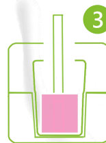
Insert the Test